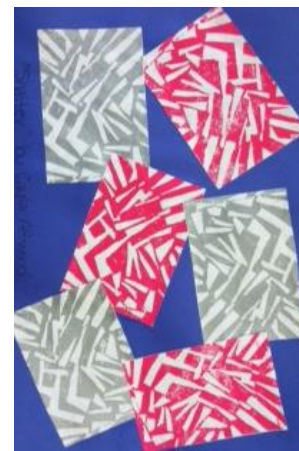
Op Art Print